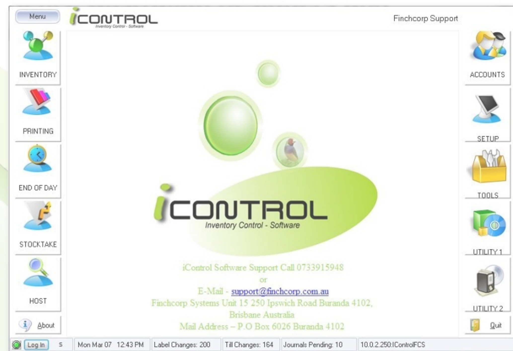
iControl home screen